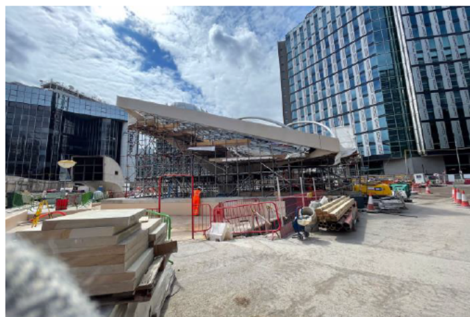
Above and below: Construction of new main station entrance roof Below: View from inside the Main Station entrance birdcage scaffolding structure

We thank you for your ongoing patience while we complete the essential improvement works at Old Street.