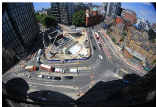
Aerial view of Old Street junction June 2022