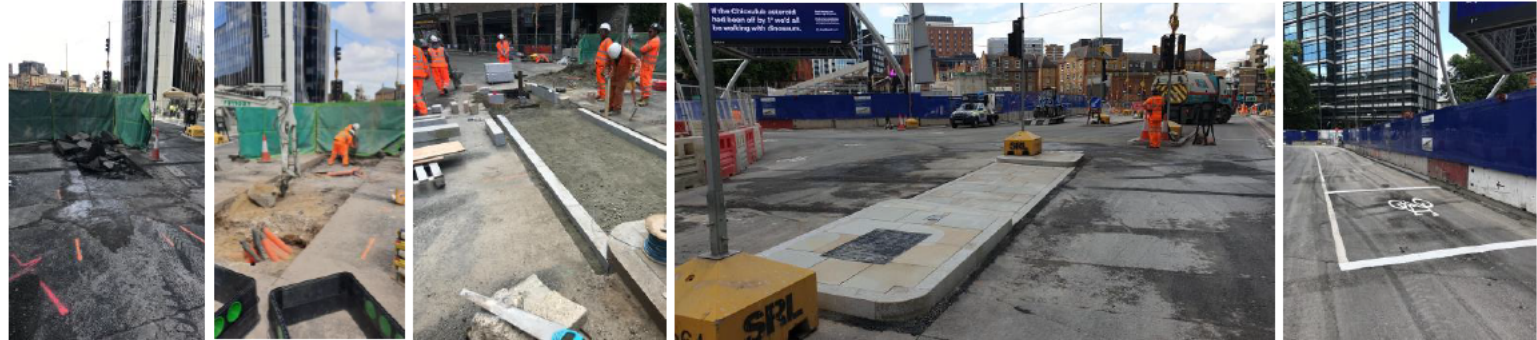
Installation of traffic islands at Old Street junction

Our recent traffic management weekend was successfully completed between 10-12 June 2022. Over the weekend we completed a large scope of works, with a particular focus on highway and surface level works such as traffic islands, lighting columns and signals that will allow the junction to operate safely in its layout for the final phase of the project.